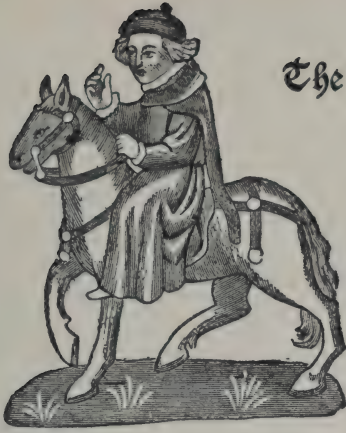
The Nun's Priest